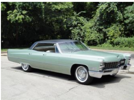
Klaus Deisinger's, 67 Sedan DeVille- 2nd place, primary #9!