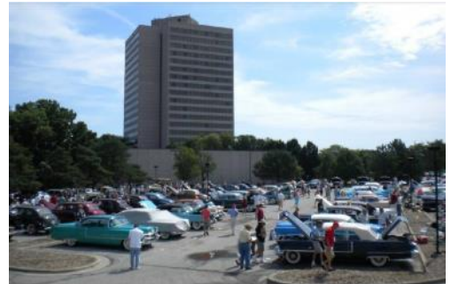
The Doubletree Hotel Overland Park-Corporate Woods, Overland Park, Kansas 2010 CLC Grand National Host Hotel

Twenty-One NTXCLX members, cars, and merchandise arrived in KC to make TEXAS' imprint at Grand National. We also enjoyed outstanding tours, entertainment, and all the goody bags.